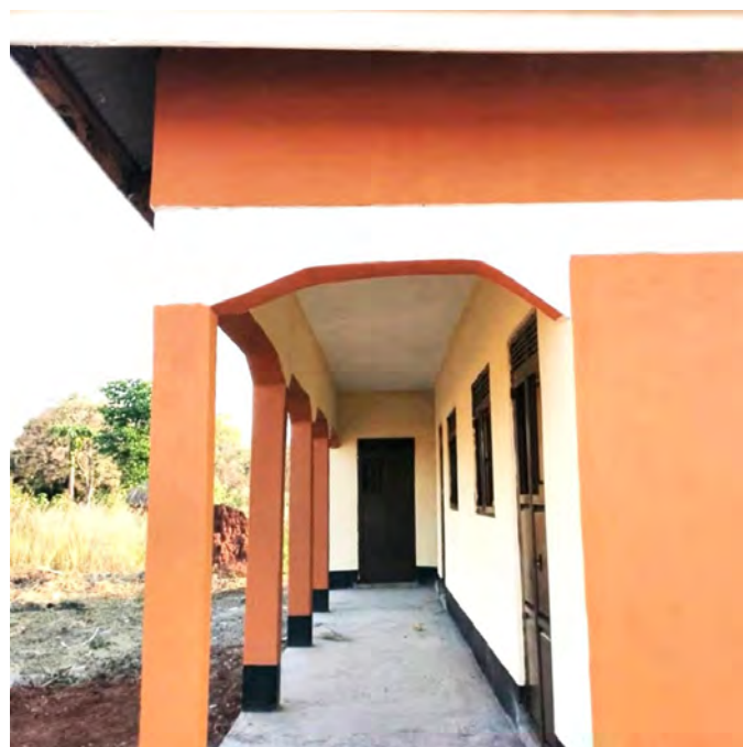
A side view of the women's refuge At Tombura-Yambio. The washrooms are being constructed at the back of the building.