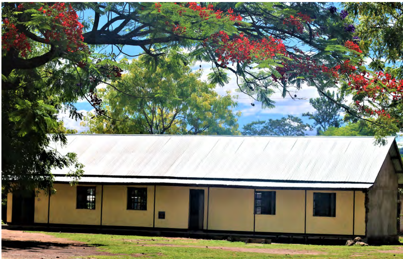
Two classrooms at St Jude's were constructed thanks to SHOCC funding. The school now has ten classrooms, a spacious dining hall capable of seating 300+ pupils and has opened a boarding section for its final year pupils.