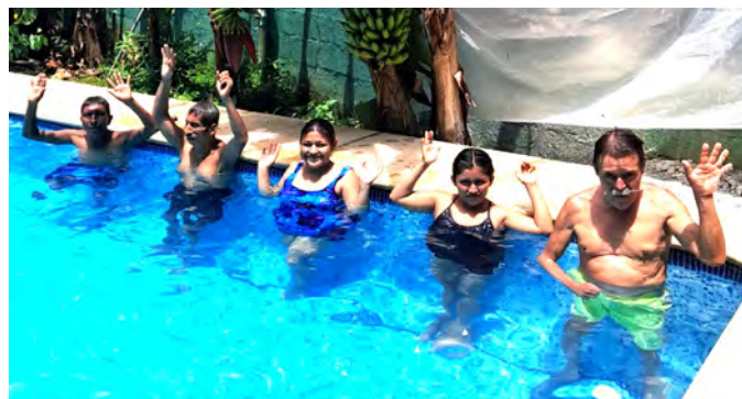
Patients exercising in the SHOCC funded hydrotherapy pool at the St Mary's hospice.