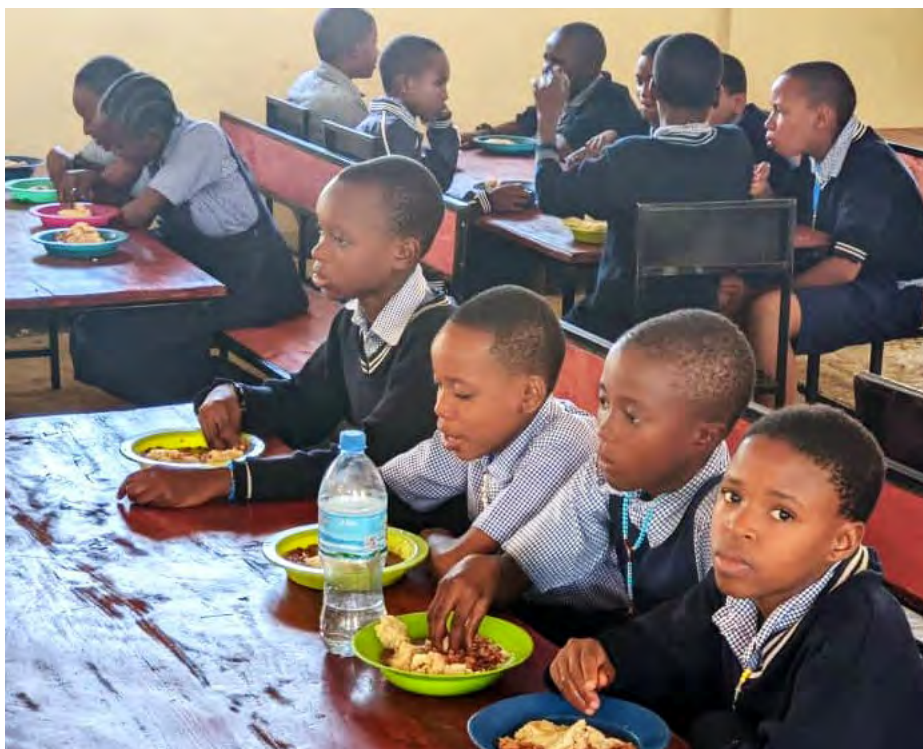
Left: Pupils at several schools have been provided with nutritious school lunches funded by SHOC/ SHOCC. These young children are enjoying a meal of maize and beans in the SHOCC funder school hall at St Jude's Academy, Mto Wa Mbu, Tanzania.